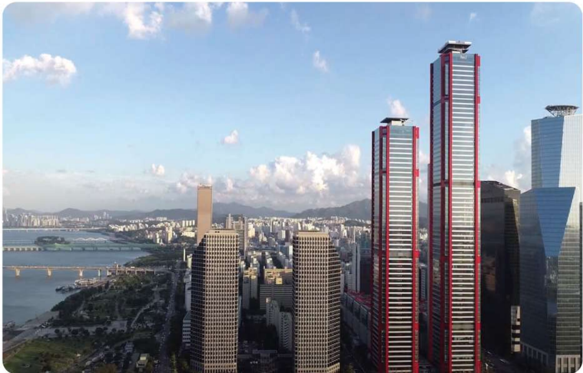
Picture of 63 Building & Parc.1